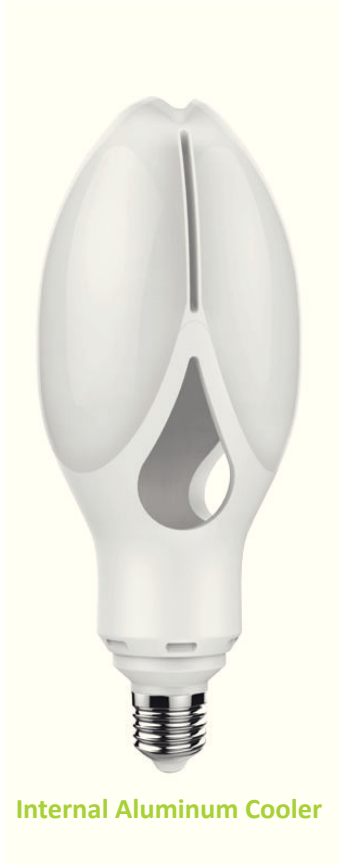
Internal Aluminum Cooler